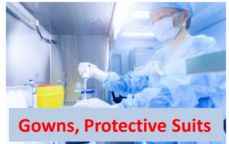
Gowns, Protective Suits