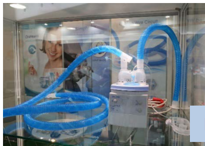
Disposables Tubes, Parts