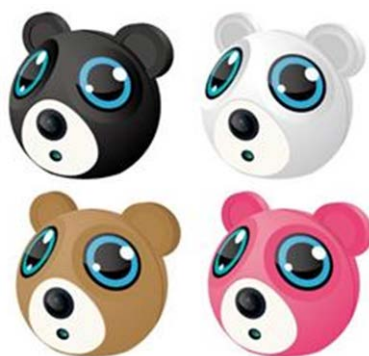
Care camera with Artificial Intelligence for homecare and elderly care facility