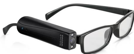
Most advanced Artificial Intelligence device for the blind and visually impaired