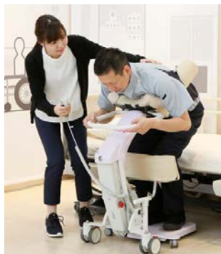
Mobility Support Robot to support transferring and standing position

<Excerpt of Exhibits at MEDICAL JAPAN TOKYO 2019>