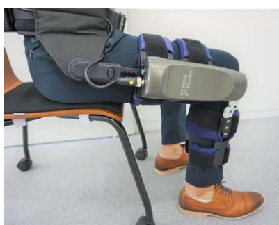
Compact single joint exoskeleton robot with several special muscle training models